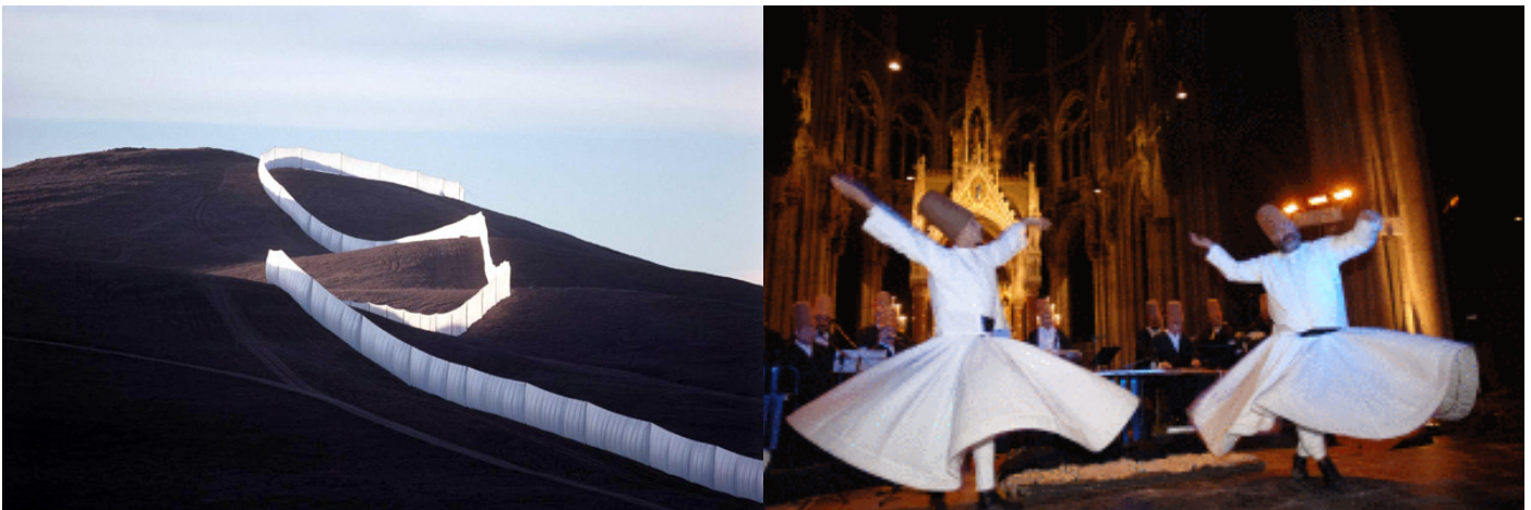
Running Fence: Christo/Jeanne-Claude

Though the structures cubature gently interacts with the environment, the design of the House of Arts and Culture is one that powerfully conveys creative ideas and energies to the outside world. White ribbons ebb and flow, reminiscent of light curtains in a soft breeze. The facade invites curiosity about the cultural life in the interior, and lays a nurturing, protective blanket around the “creative institutions” within.